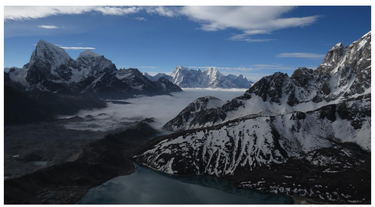
View from Gokyo Ri