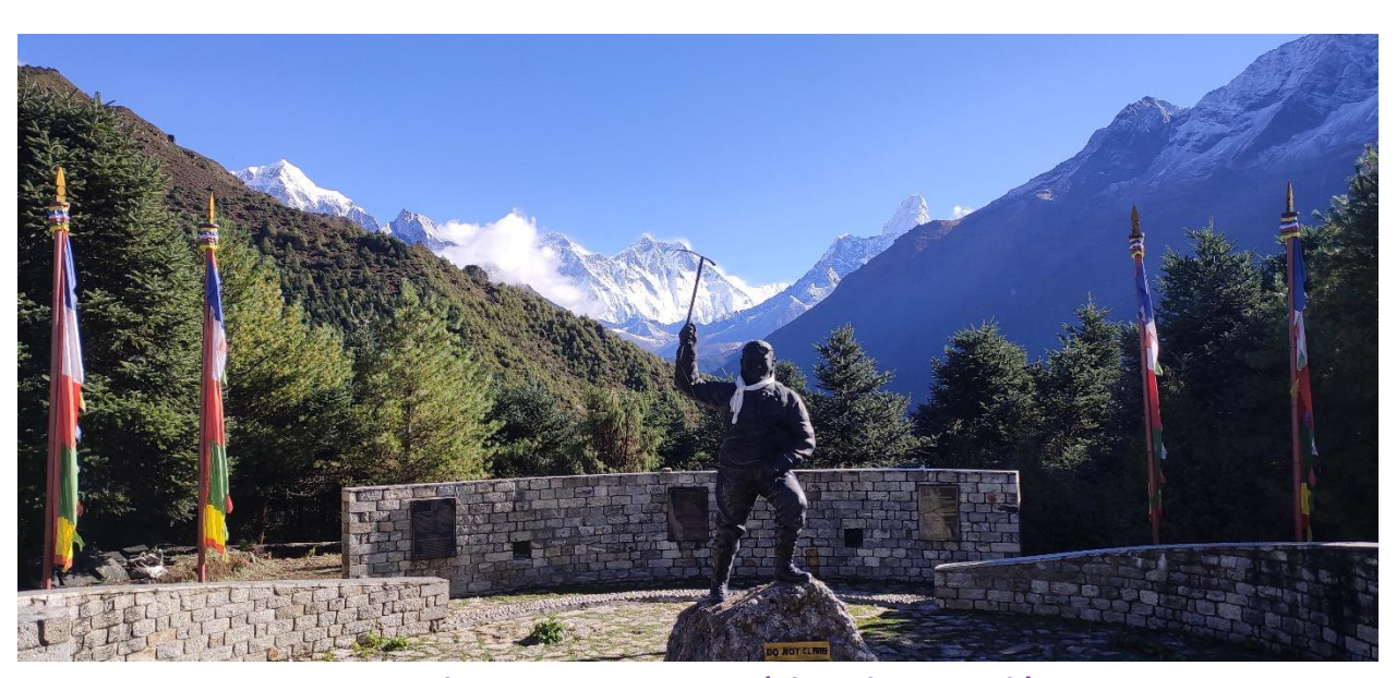
Namche Everest Viewpoint